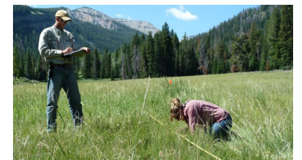
Above: Rangeland Monitoring in the BTNF

Both GIS and GPS capabilities on all of our